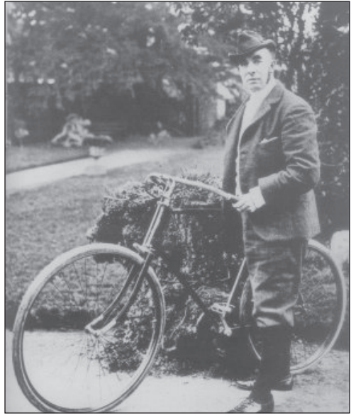
John Sholto Douglas, Marquess of Queensberry.