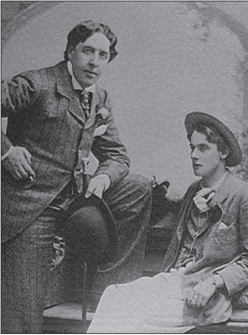
Oscar Wilde (left) and Lord Alfred Douglas.

at the thought of his son embracing the effete Wilde. He began hounding and threatening the pair, attempting to intimidate them into breaking off their relationship. Eventually, the hostilities brought them into court, where Oscar Wilde's conduct proved even more self-destructive than Bill Clinton's.